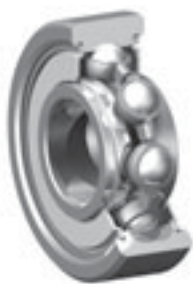
Shielded Ribbon Cage