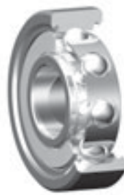
Shielded Crown Cage